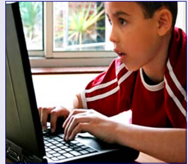
Café ASPIRA helps parents protect their children online.

The Café Aspira website, found at www.cafeaspira.com , in both English and Spanish, covers malicious programs, discusses cyberbullying and identifies various types of cyber child sex offenders and their methods. The site also features a section on cyber fraud, covering phishing, credit card scams and identity theft schemes. Café Aspira provides advice and links to resources about keeping safe, as what to do if victimized. (contd. on pg. 3)