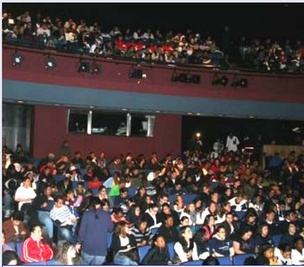
Students fill John Jay College's auditorium for the start of ASPIRA's 2008 City Youth Conference.

More than 700 high school students attended ASPIRA's 15th Annual City Youth Conference at John Jay College in Manhattan. Workshops covered a variety of topics, such as money management and immigration policy. Students participated in workshops led by distinguished experts in their respective fields. Workshops included: